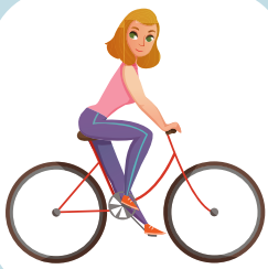
Riding a cycle

Which takes longer time? Circle the right answer: