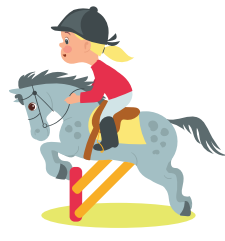
Riding a horse