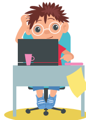
reading an article