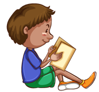
reading a book