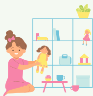
Playing with a doll